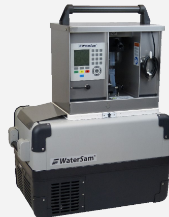
WS Porti 1T - 12T