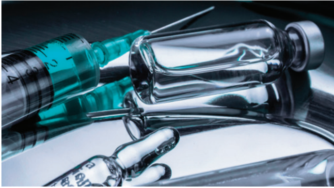
Vaccine & Pharmaceuticals