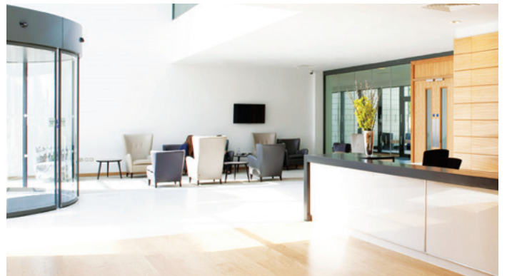
Medical Centres & Healthcare