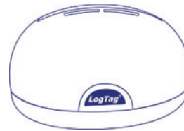
LTI HID Not Included