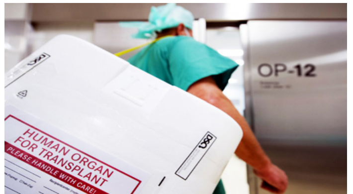
Blood & Organ Transport