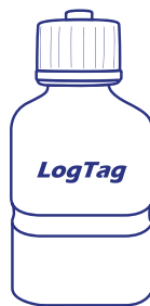
Glycol Buffer Not Included