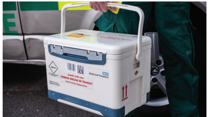
Blood & Organ Transport