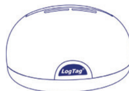
LTI HID Not Included