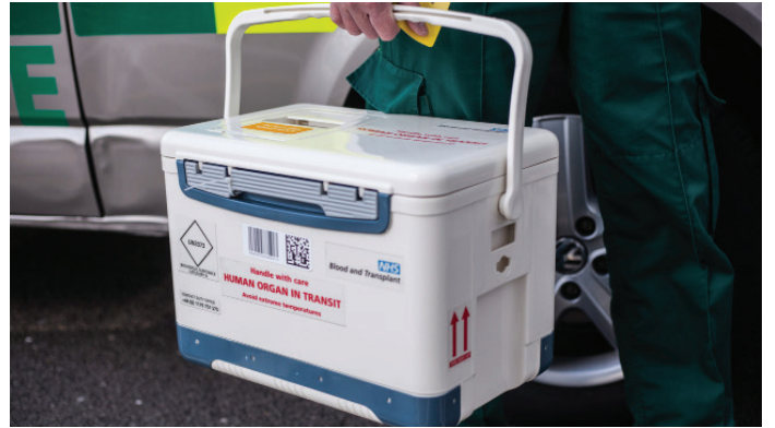
Blood & Organ Transport