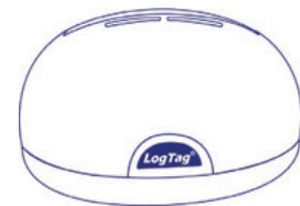
LTI-HID Not Included