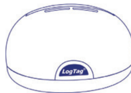
LTI-HID Not Included