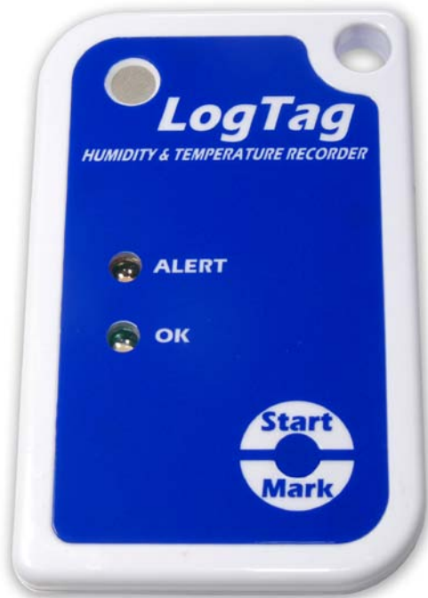
Product code: HAXO-8 (Approximate actual size)

The LogTag Humidity & Temperature Recorder measures and stores up to 8000 sets of high resolution humidity and temperature readings over 0 to 100%RH & -40°C to +85°C (-40°F to +185°F) measurement ranges.